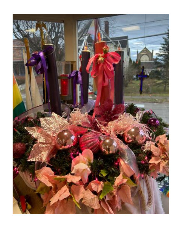
Leader -2: Please be seated. Today we celebrate Gaudete Sunday. Gaude is Latin for Rejoice! Gaude, Gaude. The Alleluia Joy of God has set us free. Even the dark of winter night is transformed in the joyful Light of Christ.

ALL: Rejoice! Everybody Rejoice! God has called every person of every ethnicity, gender, orientation, and state in life into the eternal family of God. Behold what love the God of all creation has bestowed upon us by creating us to be God's family.